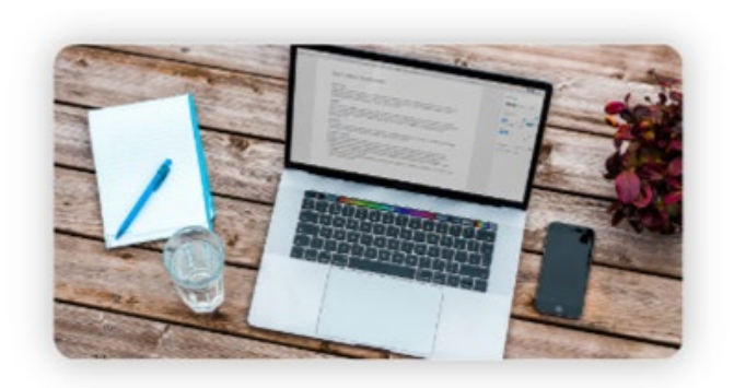
Support the Development of Digital Literacies